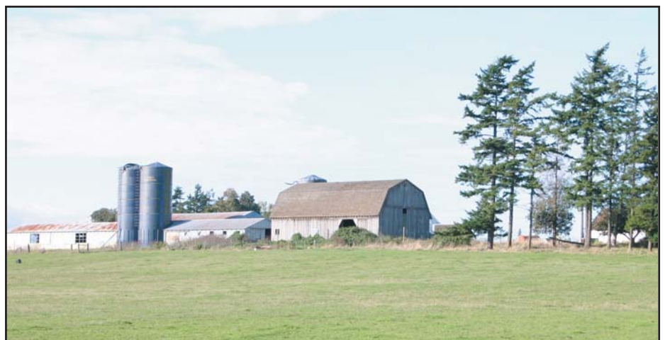
One of the proposed sites for the natural resources center

To get a vision of what the site may include, visit a model program in Battleground, Washington, www.casee.org .