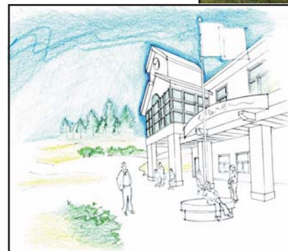
Above, site for new elementary school on Church Road, looking east toward Mount Baker