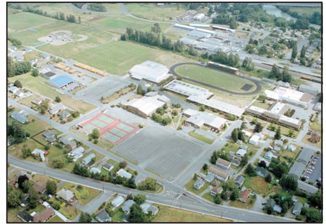
Ferndale High School Campus

installing a new scoreboard and sound system, upgrading electrical components, improving grandstand lighting, providing storage under a portion of the stadium and enlarging the concessions area.