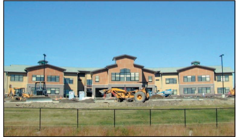
Cascadia Elementary School